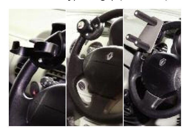
A range of steering wheel grips

Spinners come in several shapes to suit different types of grip (£15 - £110).