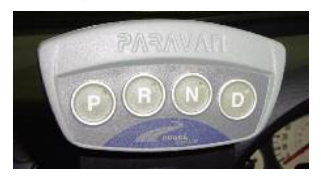
Electronic gear selector

Mobility Centre before investing in one of these systems.