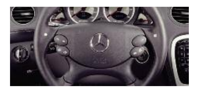
Gear controls on steering wheel

Some manual cars have automated gear systems which work without using a clutch pedal. You move a lever or use push buttons or paddles on the steering wheel to select a gear.