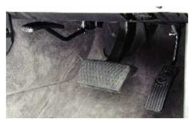
Flip up pedal – here the right pedal is down

If only your right leg is affected, one option is to have an automatic car and fit a left foot accelerator on the left side of the brake pedal, for around £400. These pedals can be removed or flipped up out of the way when not in use.