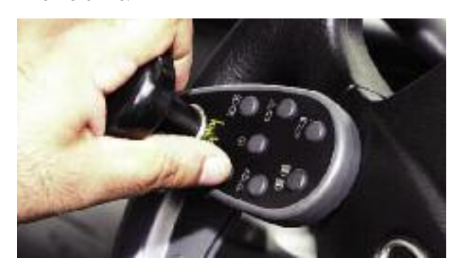
Steering knob combined with wireless secondary controls

If you have more complex needs, electronic systems can be fitted that bring all the secondary controls together in one unit.