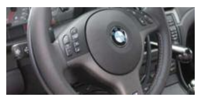
Under ring accelerator

accelerator rings need less effort than a push-pull lever and you can steer with both hands on the wheel (from £1,800)