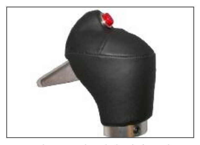
Gear stick mounted Duck clutch, from Elap

If you can operate the gear stick, but not the clutch pedal, you can fit a lever or button on the gear stick of a manual car that allows you to operate the clutch with the hand that you use to change gear (from £2,145).