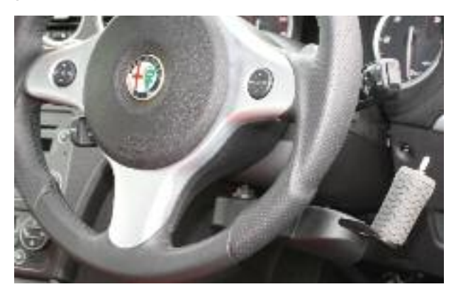
Single lever accelerator and brake – here fitted with optional indicator switch

Many people find hand controls fitted on an automatic car easier to get used to than a left foot accelerator. There are a few different types of system. They can be powered and the amount of force you need to operate them can be adjusted. You can fit a footrest, shaped to suit you (from £75), and a guard to stop your feet interfering with the pedals (from £100).